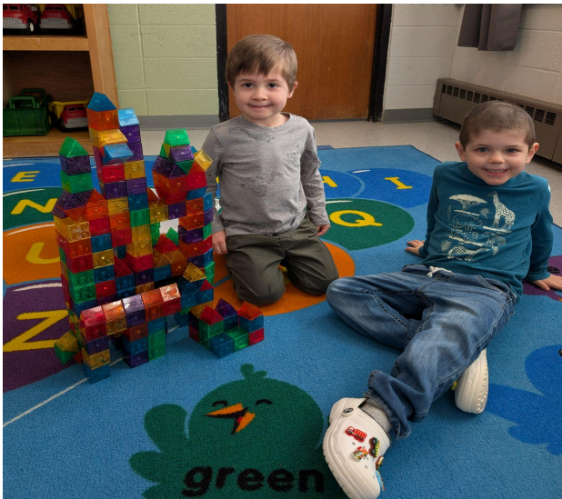
Building with Magna-Tiles